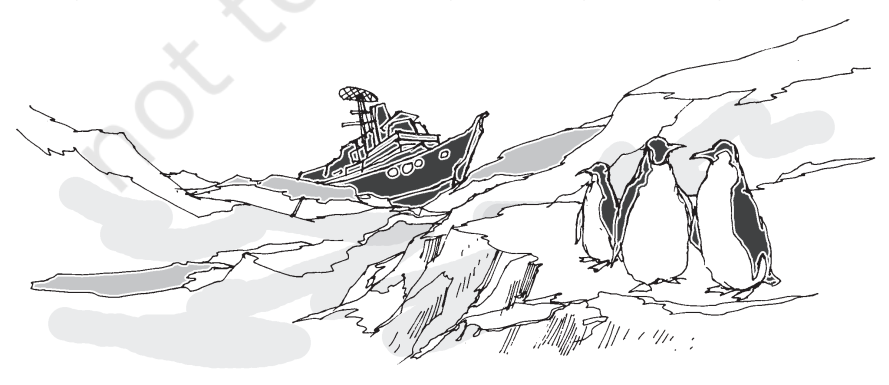
Journey to the end of the Earth \blacksquare 19

For a sun-worshipping South Indian like myself, two weeks in a place where 90 per cent of the Earth's total ice volumes are stored is a chilling prospect (not just for circulatory and metabolic functions, but also for the imagination). It's like walking into a giant ping-pong ball